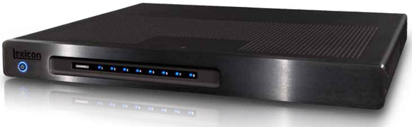
Lexicon DD-8 Multi-room Amplifier | lexicon by HARMAN